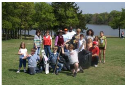
Cleanup At Baker Park

http://www.macromedia.com/software/flash/about/