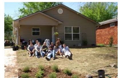
Youth From Texoma Christian School