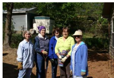
RRUU At Habitat Landscaping